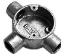
Tee / 3 Way