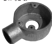
Terminal / 1 Way with Hole