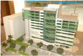
Temasek Laboratories and NUS Engineering Faculty