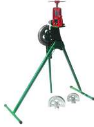
Heavy Duty Conduit Pipe Bender