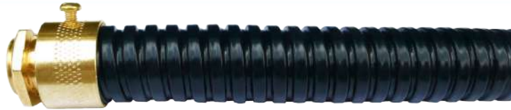
PVC Coated Galvanized Flexible conduit fitted with a flexible adapter