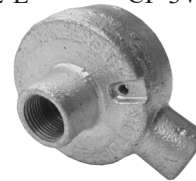
Terminal / 1 Way with Back Outlet