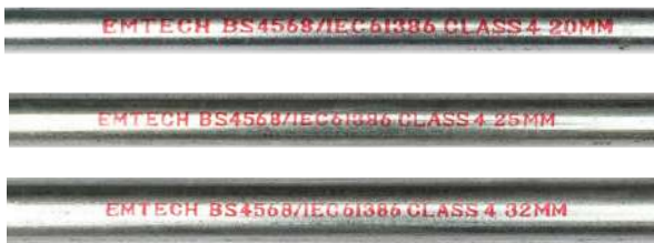
CP-20-E / CP-25-E / CP-32-E

Having been in the business of electric fittings for more than thirty years, we pride ourselves for the valuable knowledge and experience in the needs and design of conduit accessories to meet the challenge of the new millennium. In this catalogue, we offer a broad and comprehensive range of galvanized steel and brass conduit accessories which will match the demands of any projects using BS4568 / IEC61386 conduits. It is our hope that you will find the product details informative and applicable to your needs. We assure our customers that we will continue to expand and improve the range of products.