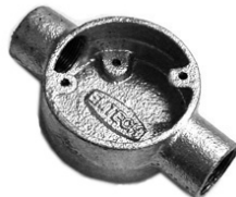
Through / 2 Way