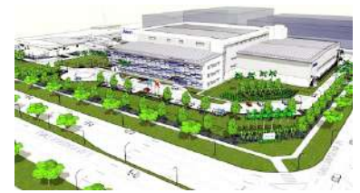
Alcon Factory @ Tuas