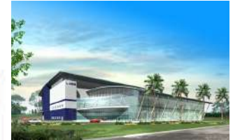
Lonza Biomedical Plant at Tuas