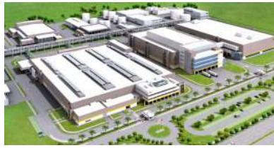
REC @ Tuas