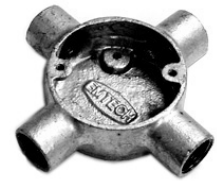
Cross / 4 Way