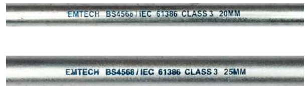
CP-20-P / CP-25-P