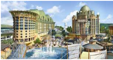
Resort World Sentosa