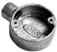
Terminal / 1 Way